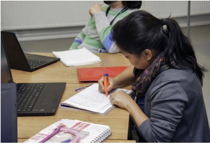
English and Maths