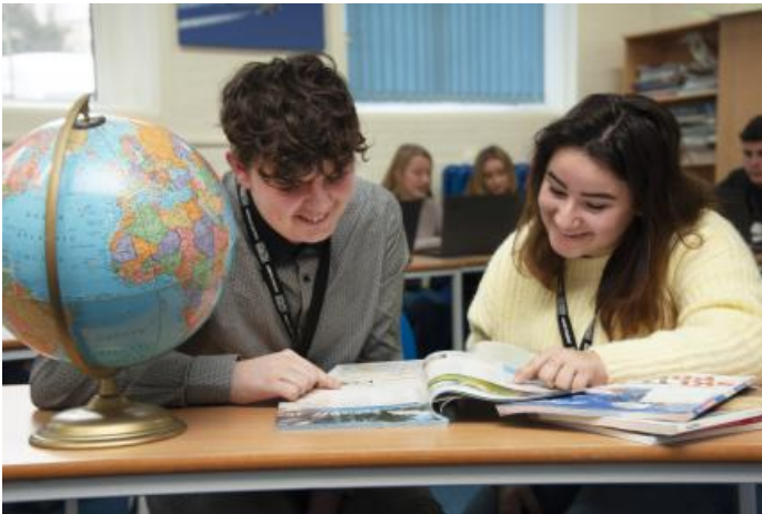
Travel and Tourism