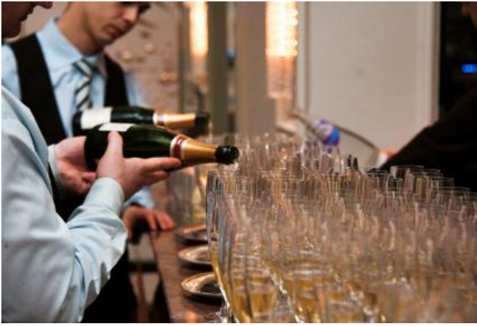
Hospitality and Catering