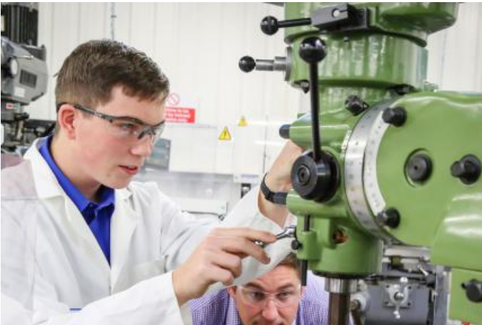
Engineering, Electronics, Marine and Automotive