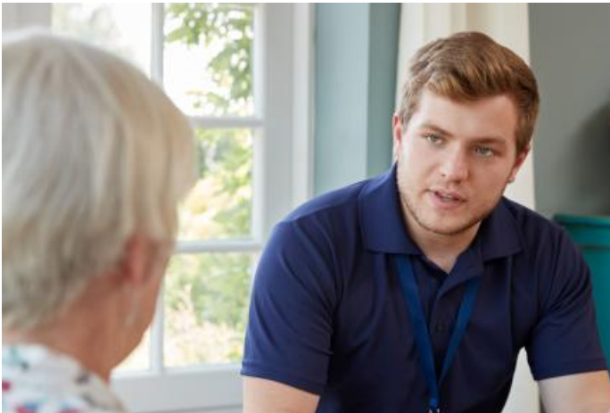
Health, Care and Education