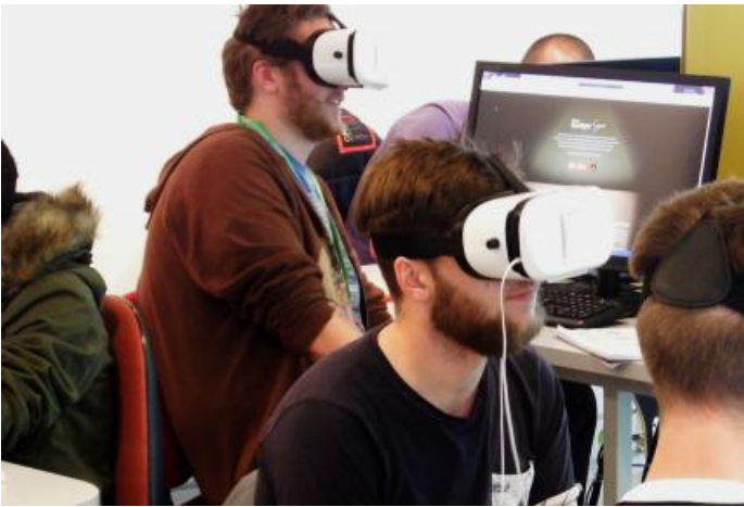
Digital, Computing and IT