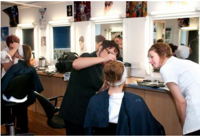
Hair, Beauty and Media Make-up