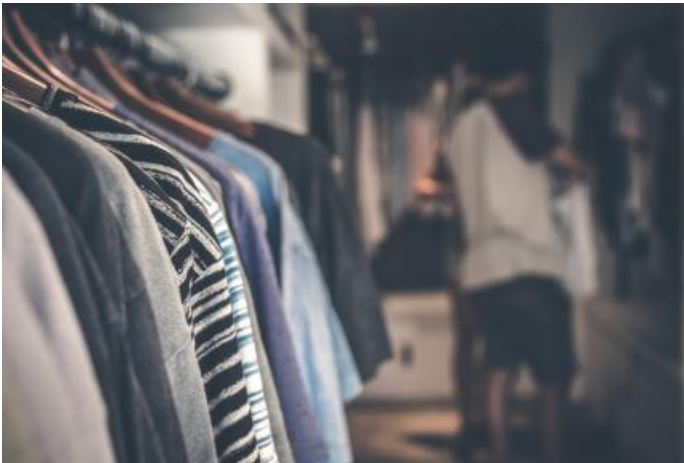
Retail and Sales