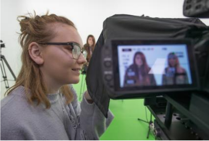
Digital Media and Esports